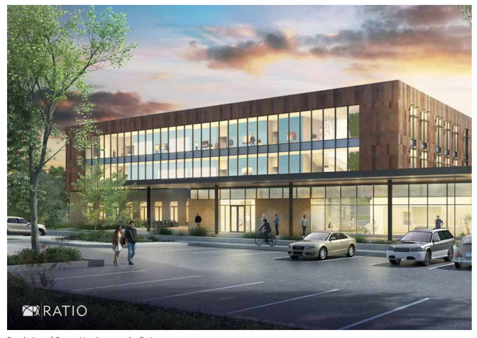
Rendering of Centra Headquarters by Ratio.